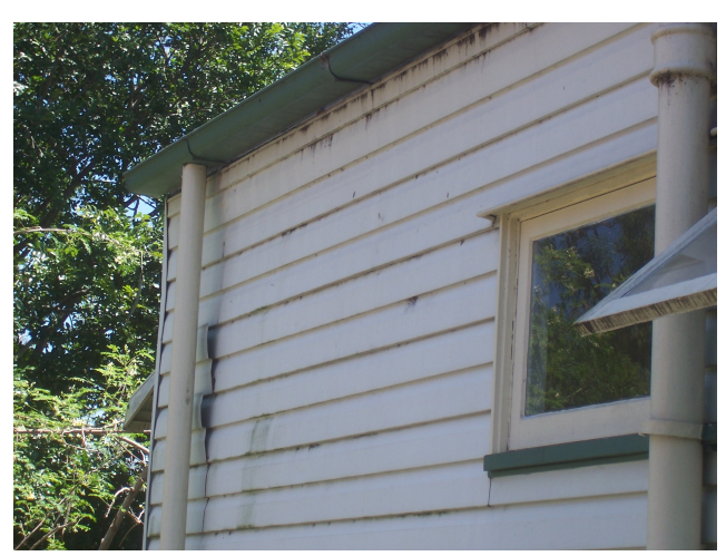
Loose cladding on hovel as there is nothing substantial beneath to which cladding can be HAIGPHOTO

the carport, another living and much more aggravation trying to study in the lounge room abuse study in the dining room with one in house.