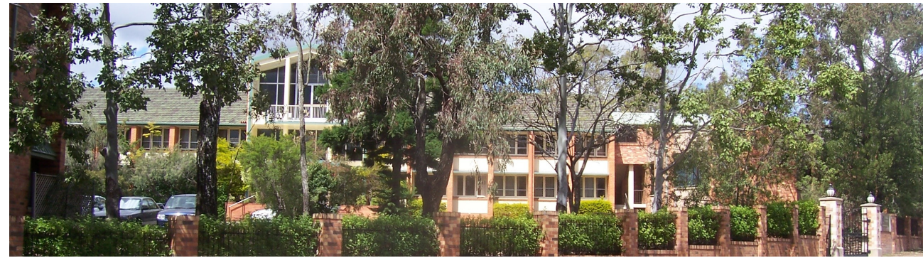
St John's College [SJC] on St Lucia Campus [SLC] of UQ.