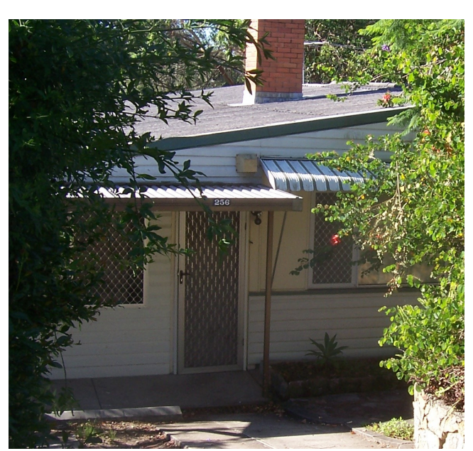
Off campus asbestos ridden hovel for "overflow" residents from SJC.

then six of them [now it will be 12] are